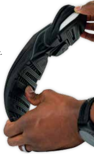
Shoe sole printed at one time in a combination of flexible black elastomer and rigid white plastic

Accurate prototypes improve communication with technicians and suppliers, reducing expensive rework. MJP is also used to make rapid tooling at a lower cost than traditional tools, jigs and fixtures.