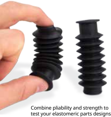
Combine pliability and strength to test your elastomeric parts designs