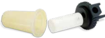
Functional filter prototype printed in clear, white and black rigid plastics