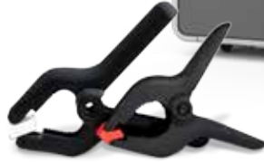
Accurate models let you check fit on complex shapes